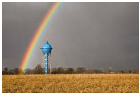
Historischer Ahleener Wasserturm