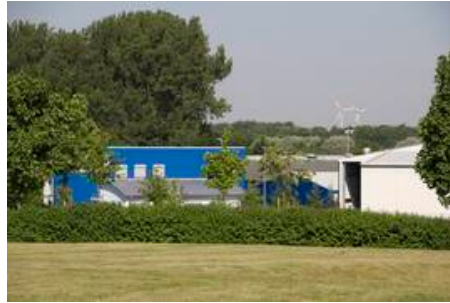
Natur- und Gewerbepark Olfetal