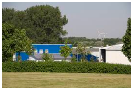
Natur- und Gewerbepark Olfetal