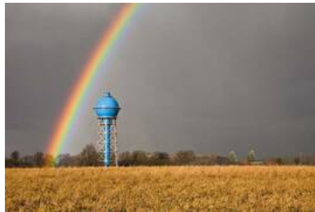
Historischer Ahlener Wasserturm