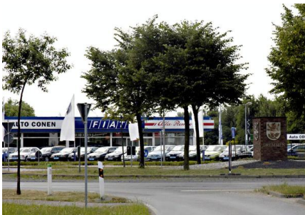
Gewerbe- und Industriegebiet Dremmen