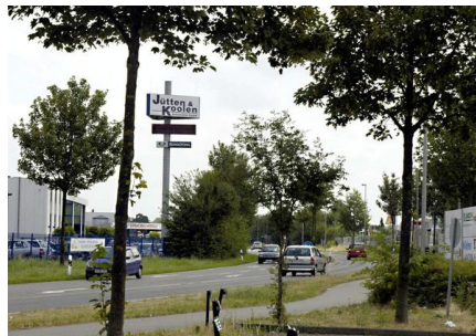
Gewerbe- und Industriegebiet Dremmen