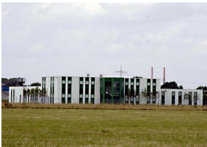
Gewerbe- und Industriegebiet Dremmen