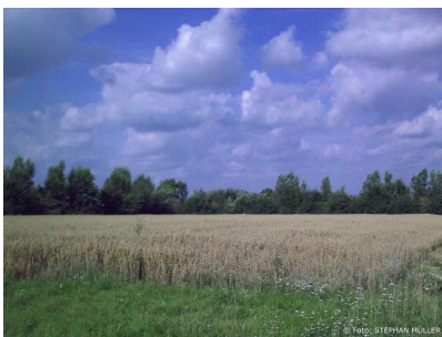
Grundstück neben GLS