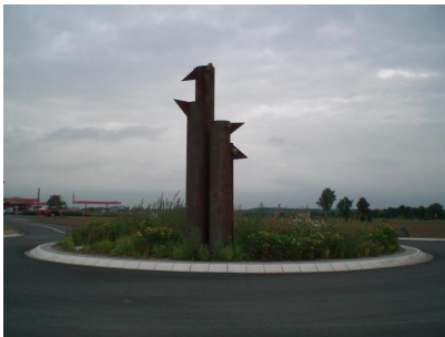
Gewerbegebiet "An der Römerallee"