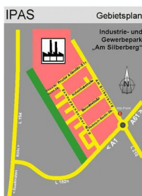
IPAS - Übersicht mit Straßennamen