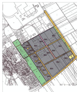
IPAS - Bebauungsplan Nr. 10 (1. Änderung)