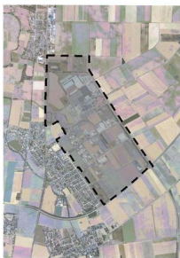
IPAS (Industrie- und Gewerbepark "Am Silberberg")