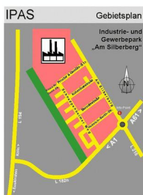
IPAS - Übersicht mit Straßennamen