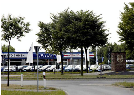
Gewerbe- und Industriegebiet Dremmen