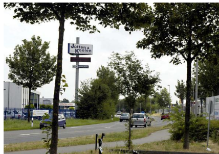
Gewerbe- und Industriegebiet Dremmen