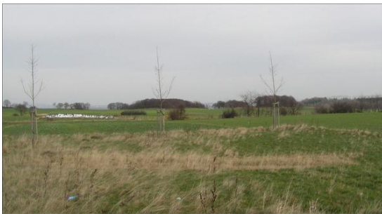
Geplantes Gewerbegebiet Gey